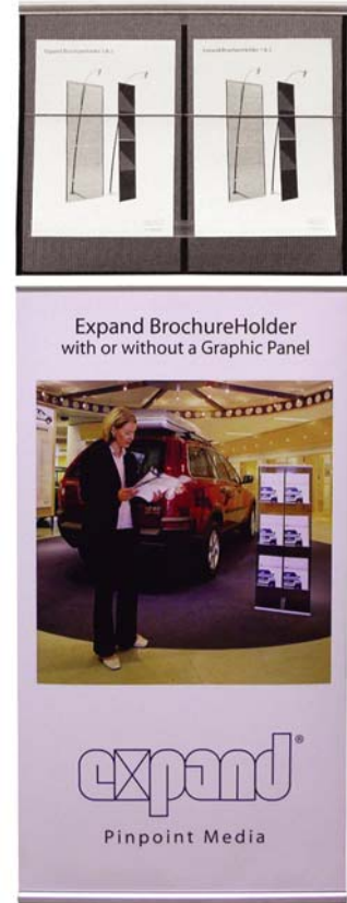
Expand BrochureHolder with 2 pockets and the ability to hold a graphic panel.

Graphic panel size is: 19 11/16" Wide x 36 13/16" High