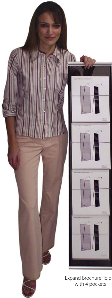
Expand BrochureHolder with 4 pockets